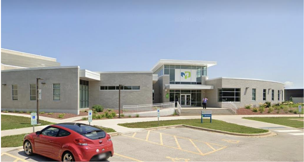
Fond du Lac County Historical Society Library: 336 Old Pioneer Road, Fond du Lac, WI 54935